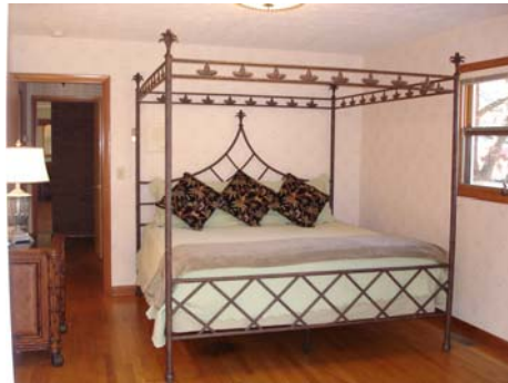
Main floor has 2 bedroom's, King / Queen bed's , both with sliding doors to deck with river views!

Family games, satellite TV, DVD's , CD player are provided. Water craft rental is within 5 minutes.