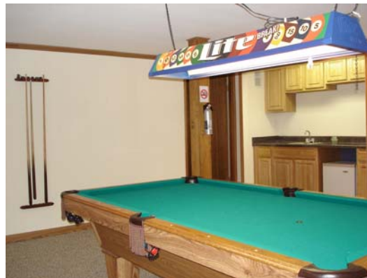
Game Room has pool table, wet bar, flat-screen TV, two bedrooms downstairs with 4 twin beds and full bathroom, futon sleeper and twin airbed.