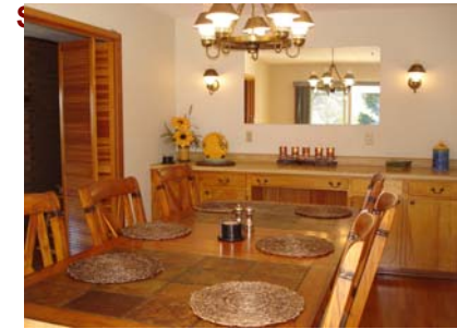
Dining room has plenty of room!