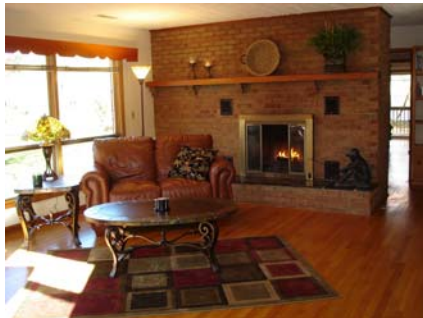
Fireplace, hardwood floors, leather furniture, tiffany lamps...all luxury!

Located on one of only two trophy trout rivers in the entire state of Tennessee.