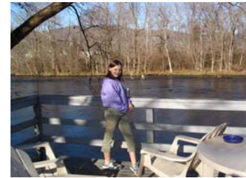
Can you see the Fly Fishermen in the background? This shows how wide the river is.