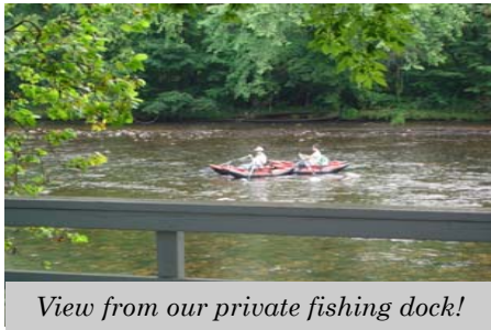
View from our private fishing dock!

Unique river getaway on 2 private acres, private fishing dock, huge deck overlooking a setting that takes you back in time.